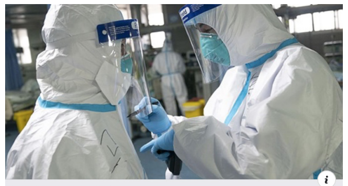
WASHINGTONTIMES.COM Virus-hit Wuhan has two laboratories linked to Chinese biowarfare program

As social scientists, we fear that such dangerous narratives are encouraging racism and hate by portraying vulnerable populations as virulent carriers, rather than victims worthy of empathy and sympathy. The outbreak comes at a time when mainland Chinese people are already facing prejudice in neighbouring